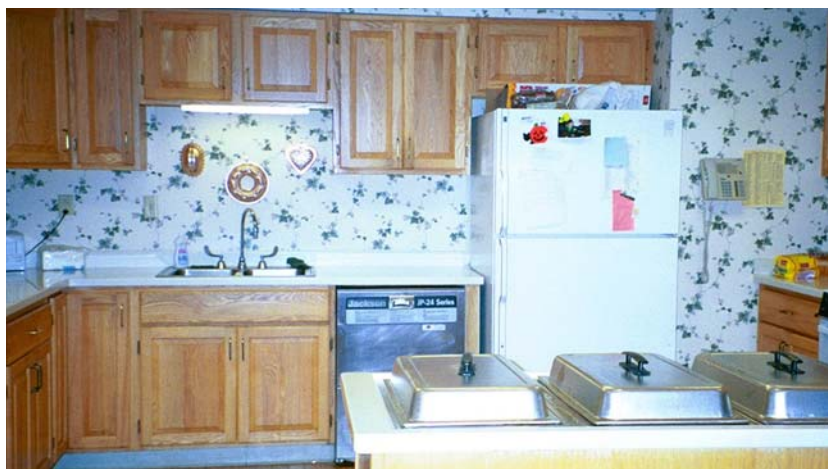
Picture 24 - Built in steam table

Picture 24 shows an alternate option of the steam table being built directly into the counter space in the kitchen on the unit. The dishes are stored in the cabinets (and washed) on the unit and salads, sandwiches, and breakfasts are prepared individually for each resident whenever they choose to eat. There definitely are costs associated with each service pattern but facility administrators say that soon savings are realized from lower staffing and reduced